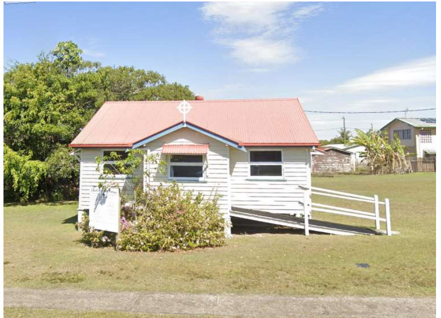
St John Vianney Church, Tin Can Bay