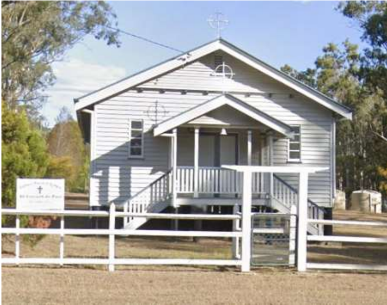
St Vincent De Paul Church, Widgee