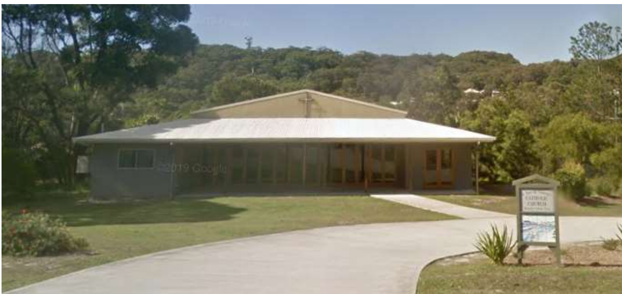
St Peter the Fisherman Church, Rainbow Beach