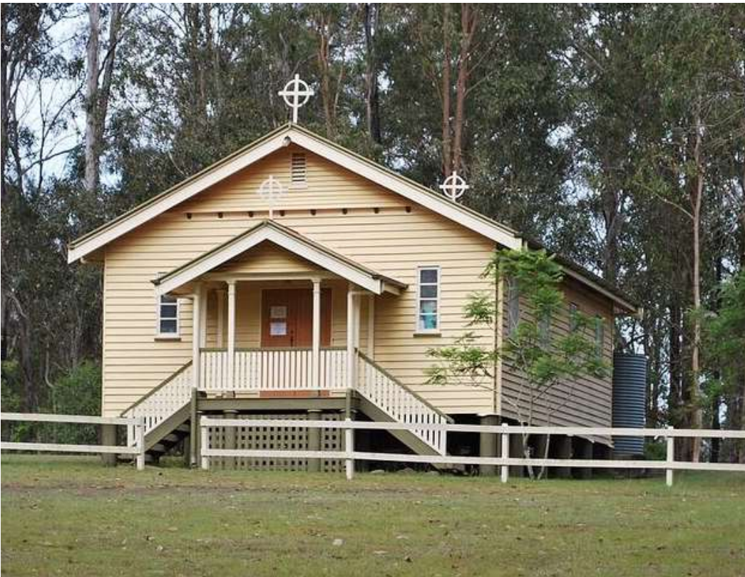
St Thérèse Church, Gunalda