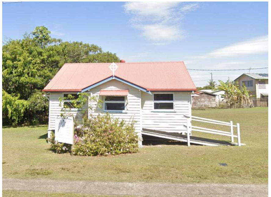
St John Vianney Church, Tin Can Bay