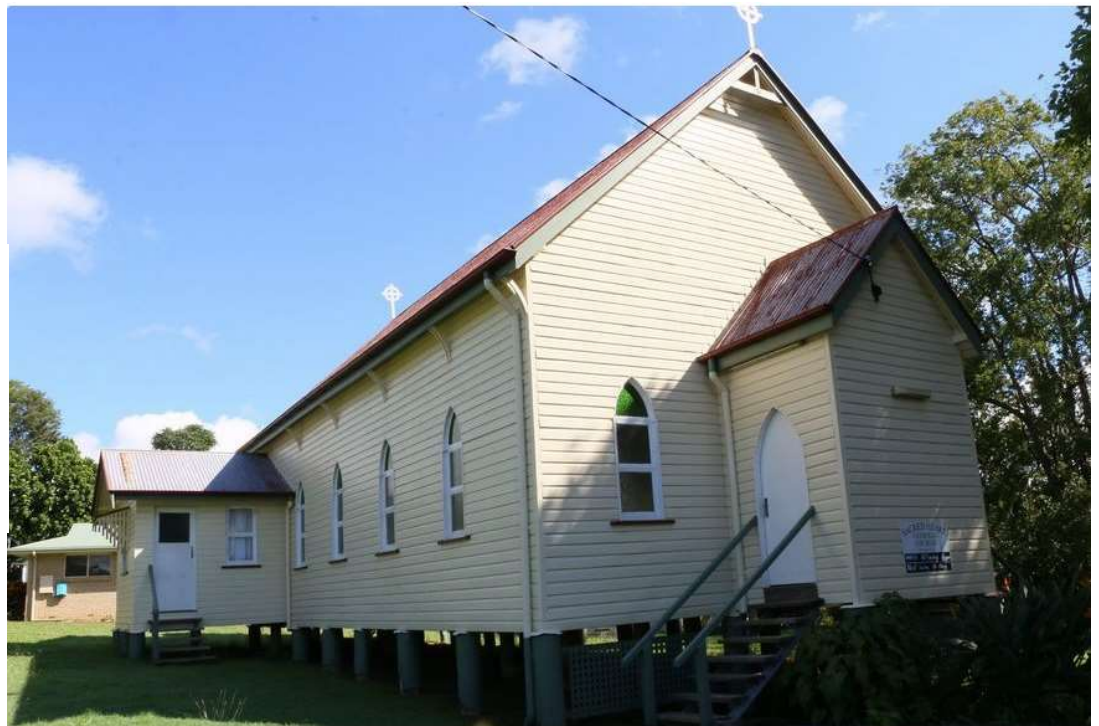
Sacred Heart Church, Kandanga