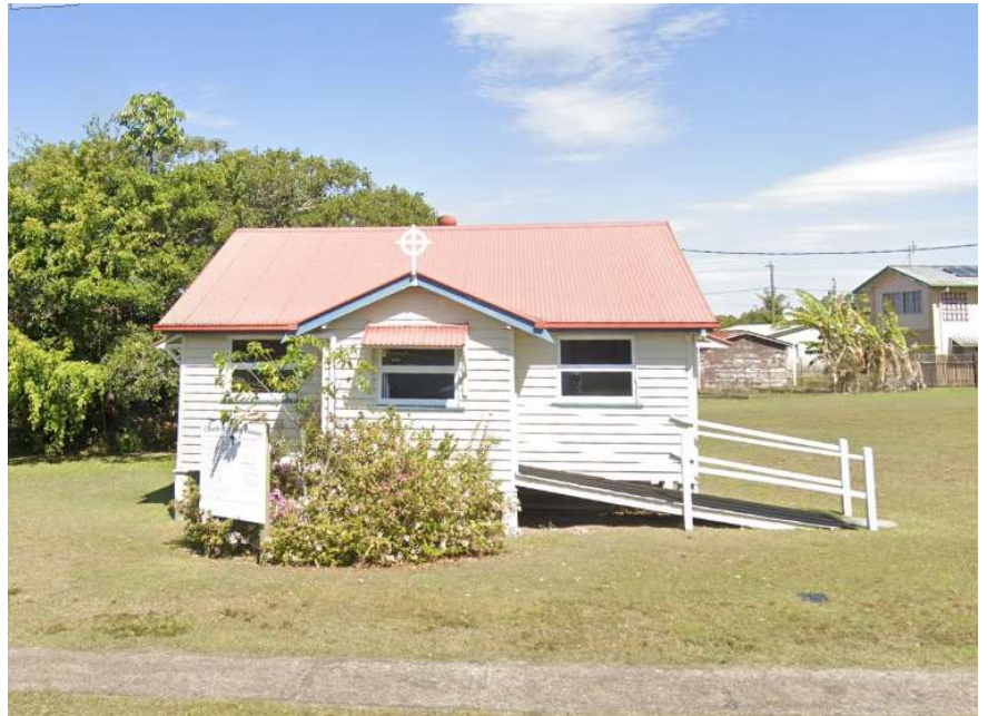
St John Vianney Church, Tin Can Bay