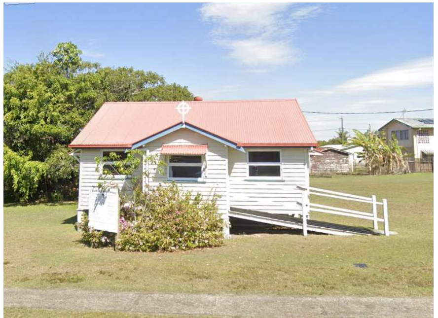
St John Vianney Church, Tin Can Bay