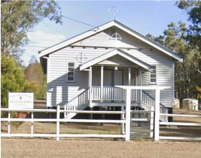
St Vincent De Paul Church, Widgee