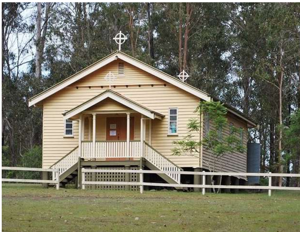
St Thérèse Church, Gunalda